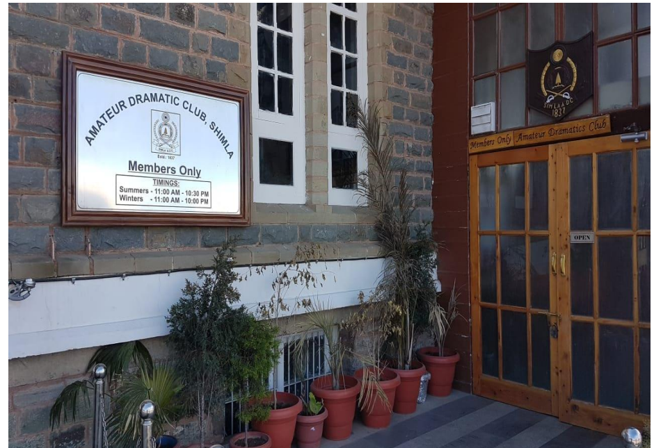
Entrance to Shimla ADC