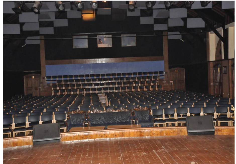
Multipurpose Hall (Gaiety Theatre)