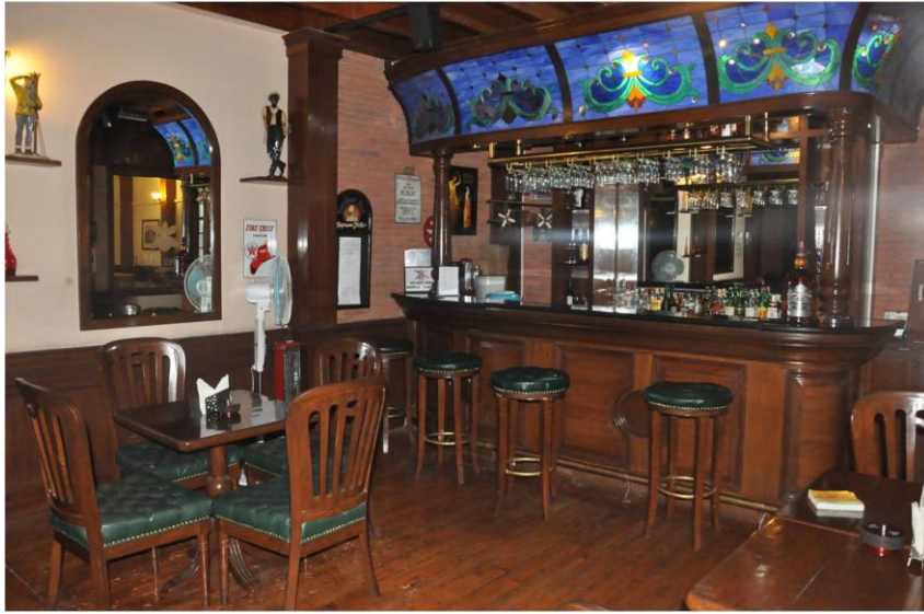
Royal Orchid Bar