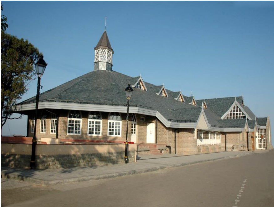
Gaiety Theatre Building