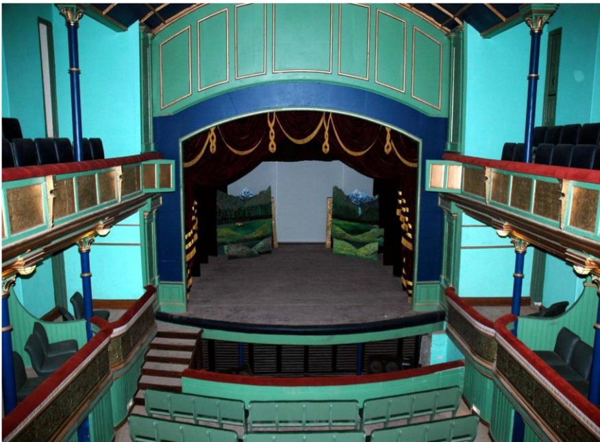
The Gaiety Theatre